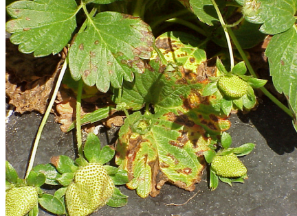
2000 Field image courtesy of David Langston.