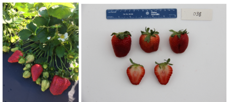
Figure 2: Shows whole plants of ‘Liz’ (NCS 10-038) including leaves, inflorescences and fruit at varying stages of ripeness and whole and sliced fruit.