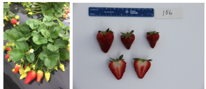
Figure 1: Shows whole plants of ‘Rocco’ (NCS 10-156) including leaves, inflorescences and fruit at varying stages of ripeness and whole and sliced fruit

‘Rocco’ and ‘Liz’ will be available for purchase from Norton Creek Farms, Cashiers, NC in 2019. Additional nurseries will have plants available in 2020.