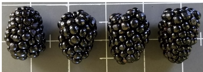
Photo: Caddo Blackberry Fruit

Caddo is a new thornless, florican-fruiting blackberry released by the University of Arkansas. The outstanding characteristics of Caddo include large berries, very good fruit flavor, overall high fruit quality, excellent postharvest fruit-handling potential, consistent high yields, and excellent plant health. Also, diversification of an early mid-season cultivar choice beyond Osage and Ouachita is considered a positive attribute. Caddo should be a commercial cultivar with good potential for shipping, as well as an option for local-market production and home gardens. Caddo is expected to perform well in areas where Osage, Apache, Arapaho, Ouachita, Natchez, and Navaho are adapted. This includes areas