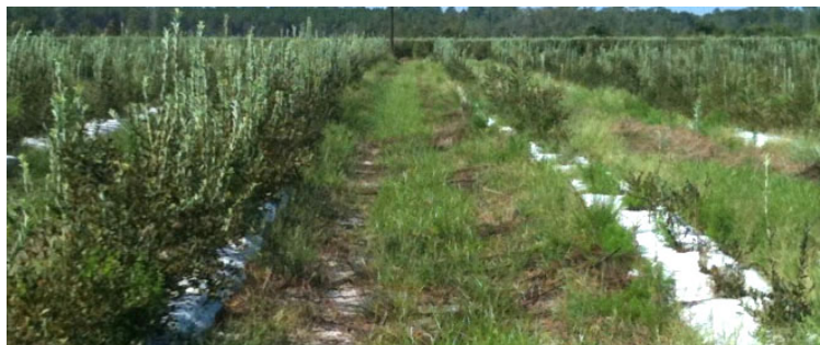
Figure 1. Blueberry on a replant disease site treated with methyl bromide (left) and untreated control (right)

Two preliminary experiments were established in June, 2008, where randomized plots of replanted blueberry were pre-treated with nematicidal soil fumigants. In these experiments, ring nematode numbers and plant vigor were determined and