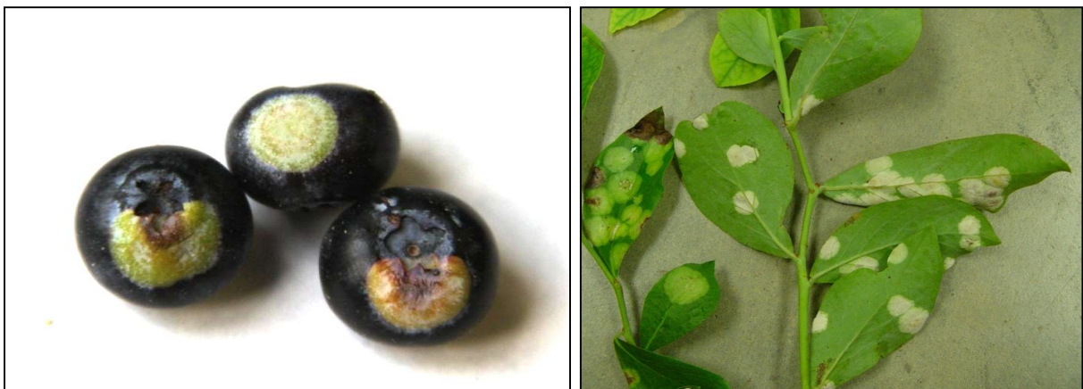
Figure 1. Symptoms of Exobasidium fruit and leaf spot. Fruit symptoms are green, firm spots and blotches that do not mature with the rest of the berry. Leaf symptoms are light green spots on the upper leaf surface which are white or lighter green on the lower surface.

Based on our previous research, late dormant (calcium polysulfide) and bloom (Captan and similar materials) applications are known to be important in suppressing the disease. However, we did not fully understand the contribution of post-bloom and early cover sprays to management of Exobasidium . Also, although Sulforix can cause phytotoxicity, there is evidence that cover sprays with this material at reduced rates may not be as dangerous as previously anticipated. In light of the strong efficacy of Sulforix when applied late-dormant, application of this product during the post-bloom and cover-spray timeframe may be of value and should be tested.