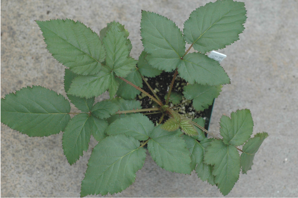
Fig. 5. Micropropagated blackberry selection NC 534 in the MPU greenhouse at NCSU.

Anderson, W.C.1980.Tissue Culture Propagation of Red and Black Raspberries, Rubus idaeus and R. occidentalis . Acta Horticulturae . 112:13-20.