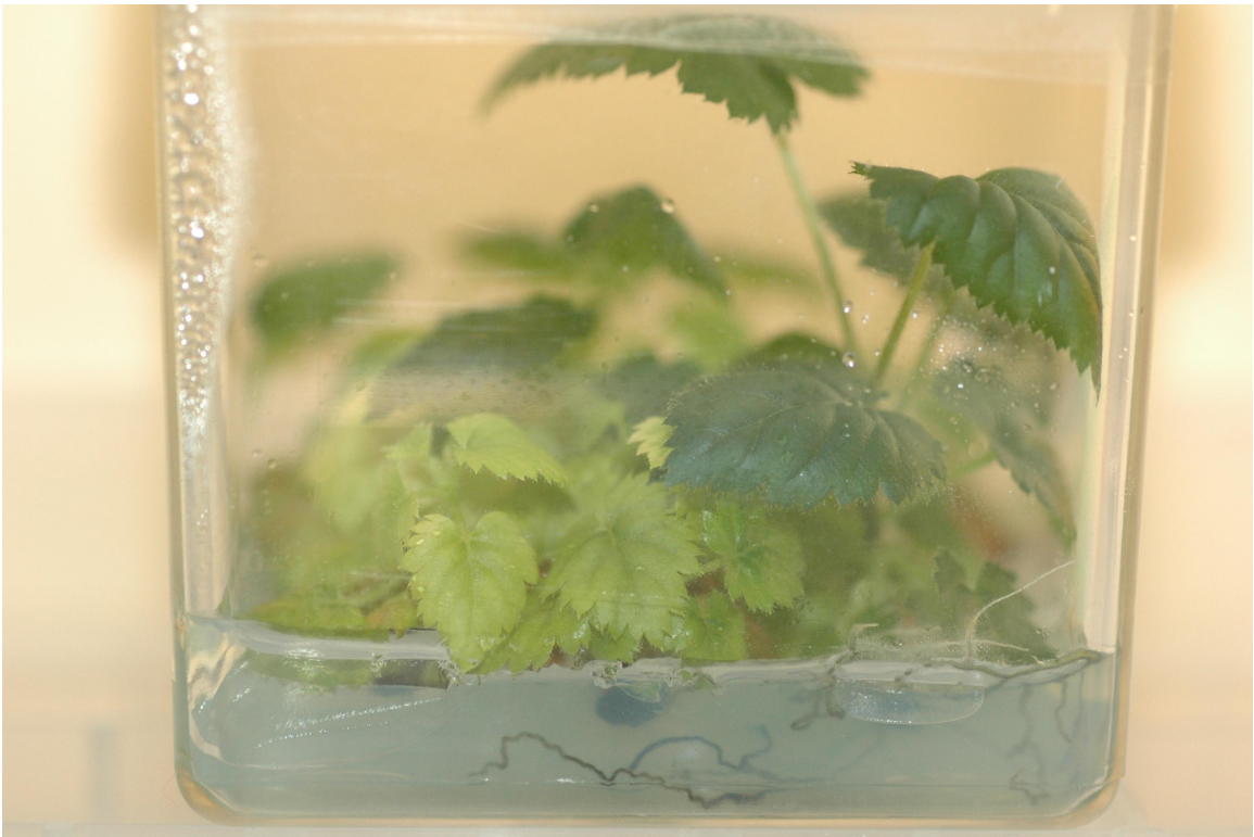
Fig. 2. Blackberry NC 533 explants in rooting medium in the MPU.