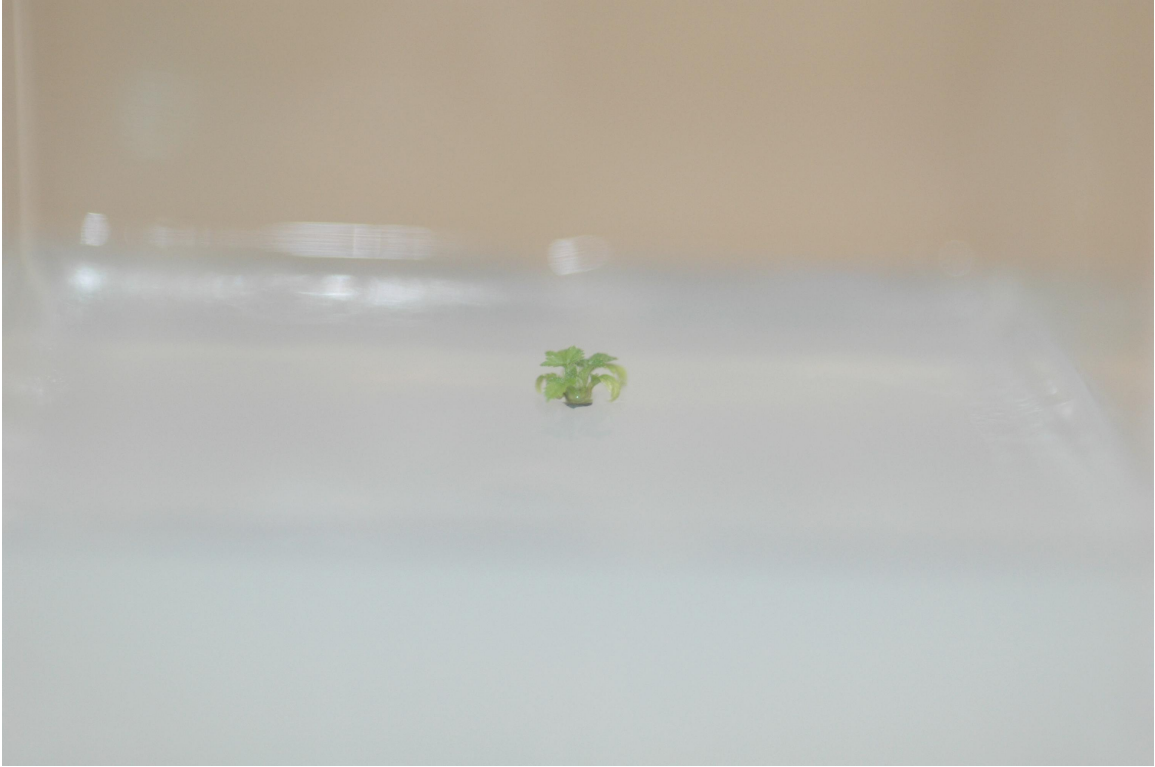
Fig. 1. Mandarin explant in proliferation medium in the MPU.