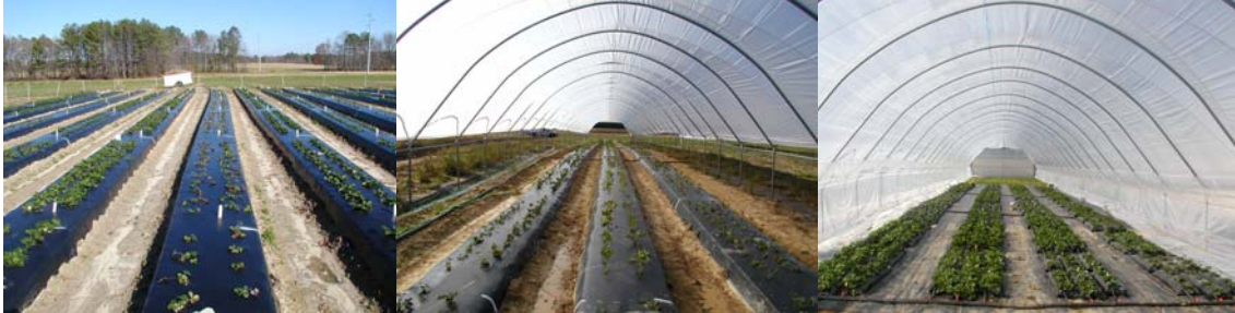
Figure 1. Conventional outdoor trial, left; conventional plasticulture in tunnel, center; soil-less culture in tunnel, right.

A multi-bay Haygrove high tunnel was erected during the early spring of 2006. Bays are 24' wide by 200' long. Trials for the 2006-07 season focused on cultural comparisons between unprotected field culture to two methods of production inside the high tunnel (conventional ground plasticulture and soil-less culture) (Fig. 1).