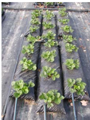
Figure 2. Plot design for soil-less culture in the high tunnel.

Plug plants of Camarosa, Chandler and Everest were obtained from commercial nurseries and planted by hand. For the conventional ground plots, both outside and inside the tunnel, rows were 5' on center with a staggered double row of plants set 12" x 14" (17,424 plants/A). Plots were fumigated with methyl bromide (200lbs/A). Soil-less plots inside the tunnel were also on 5' row centers but consisted of a staggered triple row of plants set at 12"x14" (26,136 plants/A) (Fig. 2). Conventional outdoor plots were also established with the same three cultivars including Sweet Charlie, Festival and border plots of Albion. All plot sizes for each trial was 24 plants. Plants were established over three dates (9/15, 9/29 and 10/10). Each trial was set up as a split plot design replicated four times (whole plot is planting date and sub-plot is cultivars). Plots were harvested twice a week and data collection consisted of Marketable and unmarketable yield, average berry weight, and sugar content ( ^{\circ} brix).